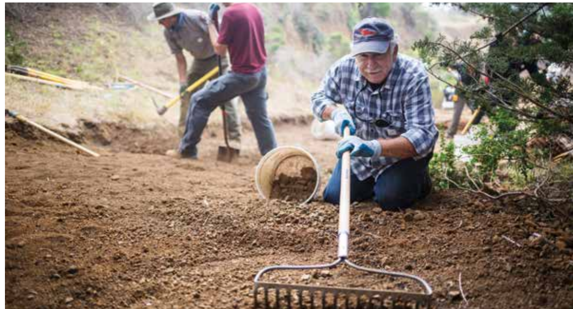
National Trails Day volunteer working at Milagra Ridge

19,000 participants served by the Crissy Field Center , through school and community programs, summer camps, Camping at the Presidio, Project WISE, educator trainings, and more • 60,000 youth served by the Conservancy, NPS, Presidio Trust, and park partners—coordinated by the Park Youth Collaborative to amplify impact • 17 I-YEL (Inspiring Young Emerging Leaders) high school interns • 66 Urban Trailblazers , comprising middle school students from diverse backgrounds • 35 LINC (Linking Individuals to their Natural Community) youth who completed a six-week leadership program—including 17 in the One Tam program • 232 interns , including Academic Interns from local colleges