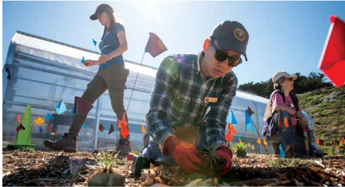
Volunteers planting native species