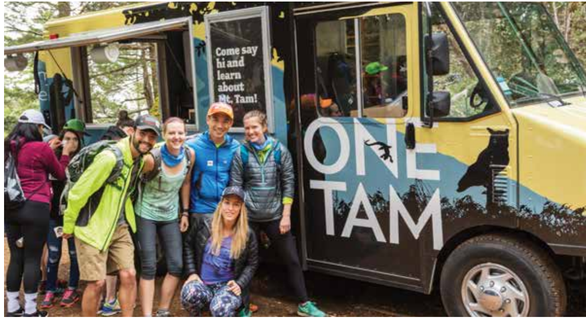
New One Tam Roving Ranger "mobile trailhead"