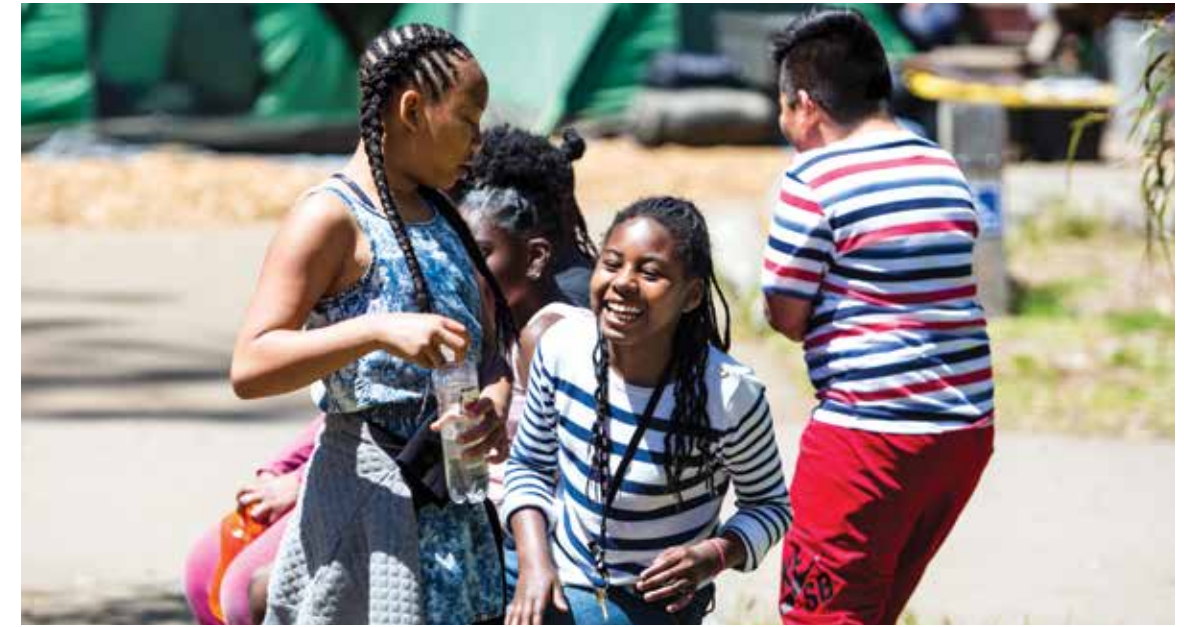
Youth in Camping at the Presidio, a program made possible by Presidio Trust funding