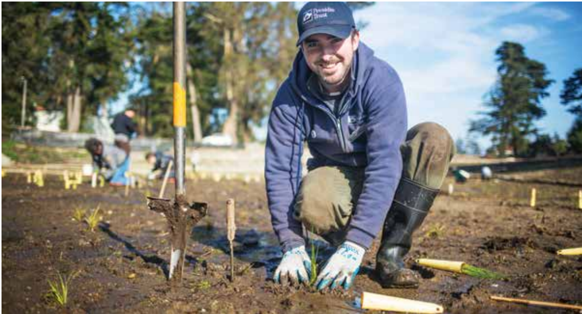
MacArthur Meadow restoration