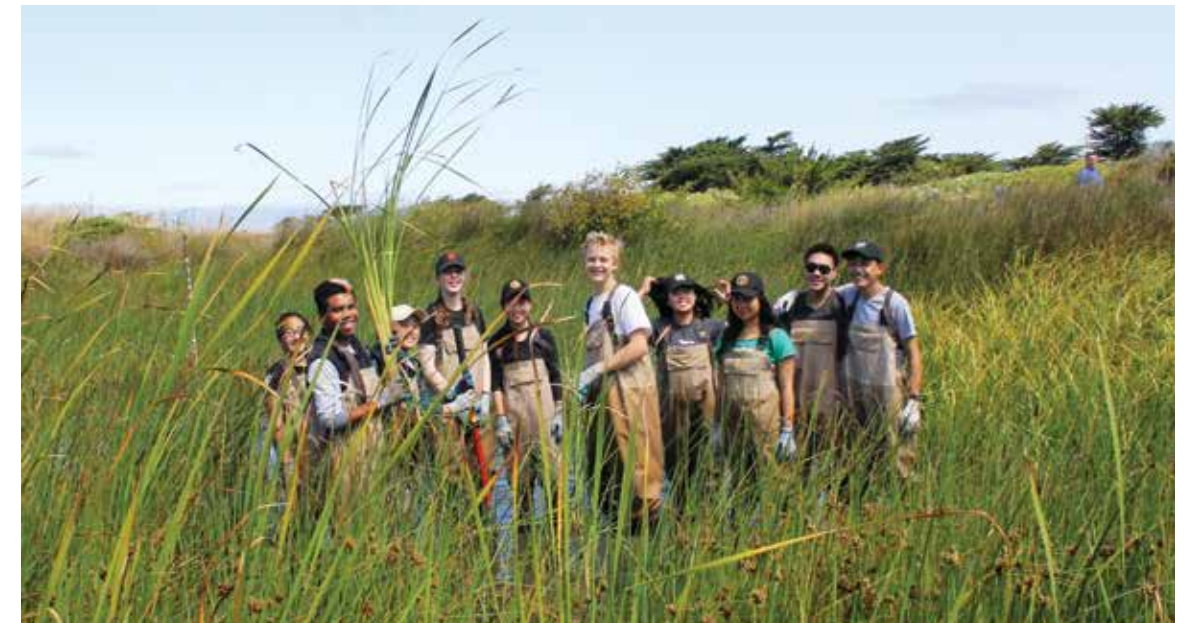
LINC youth at Mori Point