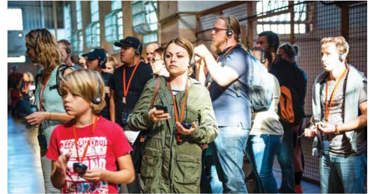
Alcatraz Cell House audio tour