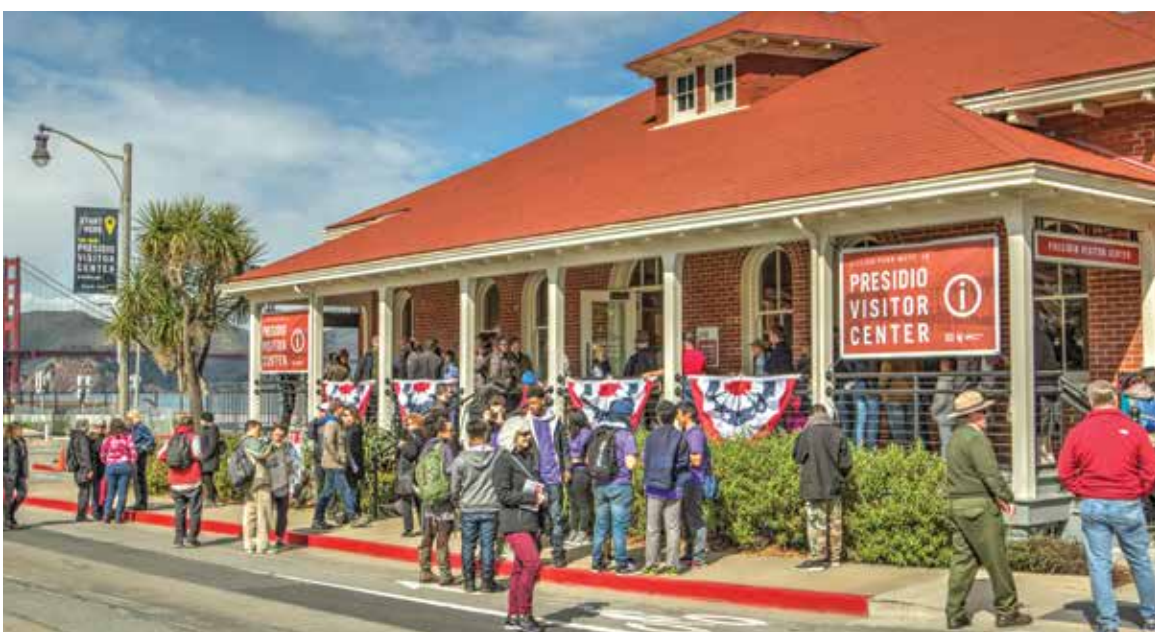
New Presidio Visitor Center

More sustainable segment of the Milagra Battery Trail • Development of new Presidio Visitor Center • Mori Point trailhead accessibility upgrades • Alcatraz Quartermaster Warehouse and Cell House rehabilitation • MacArthur Meadow restoration , part of the revitalization of the Tennessee Hollow Watershed in the Presidio • Over 131,000 feet of trail built or maintained • 200 trail and interpretive signs installed • Planning for repair of Crissy Field Promenade with safer, more durable surface • 741 volunteers in Alcatraz Gardens • Workshops on play/learning and diversity and inclusion to advance Presidio Tunnel Tops design • Preparation for Alcatraz embarkation upgrades