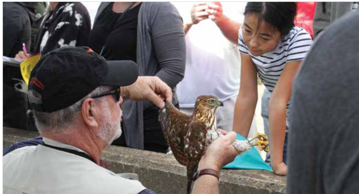
Banded Cooper's Hawk, at a GGRO “raptor release” public program

Measuring the Health of a Mountain: A Report on Mt. Tamalpais' Natural Resources , published by One Tam partners and scientists • More than 169,000 plants (of 164 species) grown in native plant nurseries for 50 restoration projects parkwide • “Rescue” relocation of endangered Mission blue butterflies at Milagra Ridge • 20,353 raptors sighted and 1,281 banded by Golden Gate Raptor Observatory “community scientists” on Hawk Hill, along with 1,000 butterflies spotted • 35,900 native plants planted • 15,800 invasive plants removed • 813,000 photos of wildlife catalogued by One Tam Wildlife Picture Index volunteers • Two “bioblitz” species counts on Mt. Tam